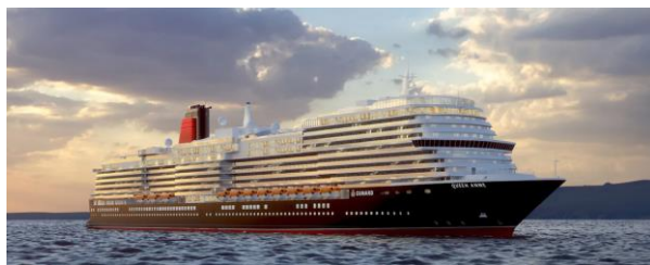
Queen Anne : Northern Europe & Mediterranean