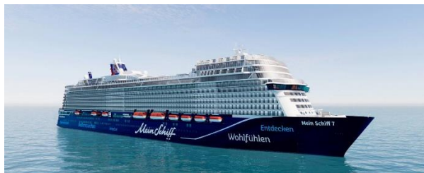
Mein Schiff 7 : Northern Europe/Baltic