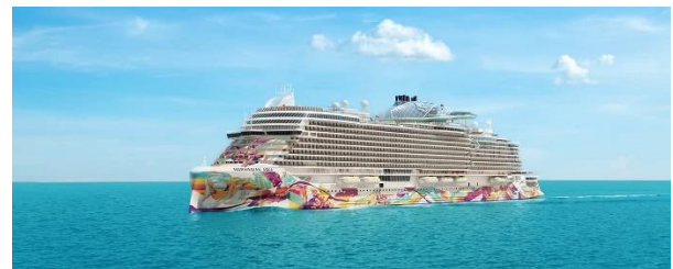
Norwegian Aqua : Bermuda & Caribbean